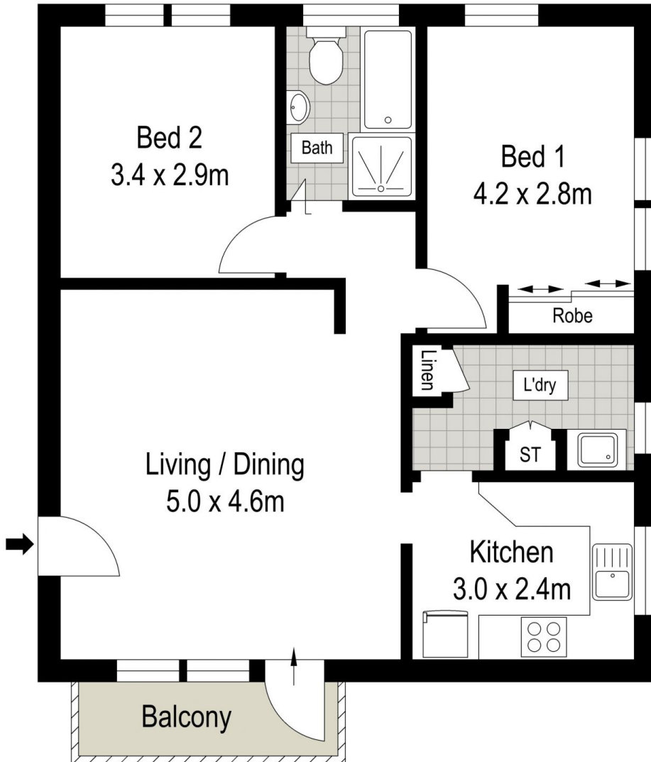
TOP FLOOR / THIRD FLOOR