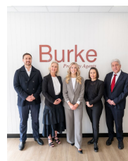
Property Management Team 02 9544 1111

View : https://www.burkeproperty.com.au/7842095