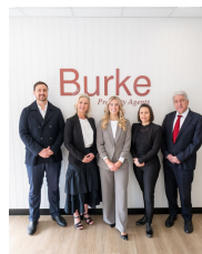
Property Management Team 02 9544 1111

View : https://www.burkeproperty.com.au/8047149