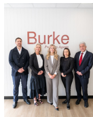
Property Management Team 02 9544 1111